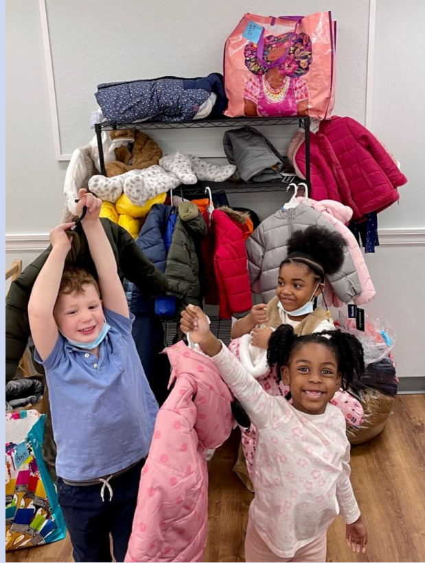
Ellis Early Learning Center

Best wishes to all for peace, hope, and happiness in the New Year!